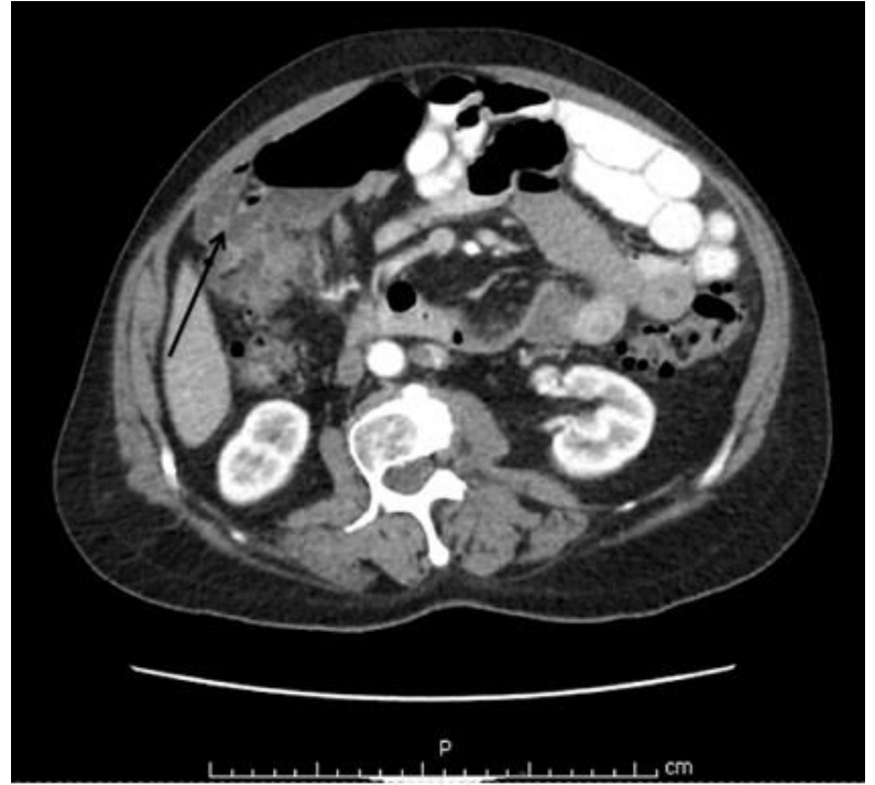
Figure 2. Axial view of the computed tomography of the abdomen with PO contrast shows proximal dilatation of cecum (white arrow) with remnant PO contrast in the small bowel (black arrow).